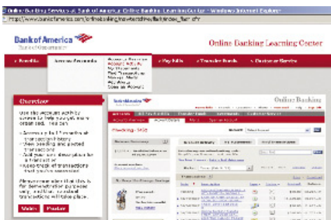
View Bank Account Activity Online