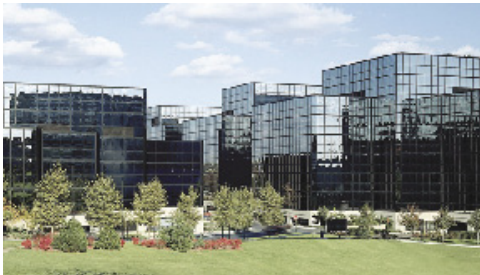
300 First Stamford Place - Stamford, CT