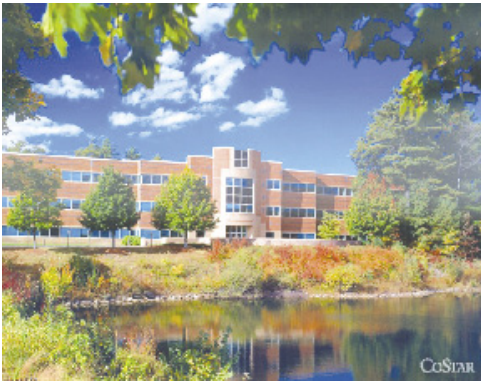
Rendering, 35 Nagog Park - Acton, MA

Nagog Office Park is a 73-acre master planned development consisting of eight office buildings totaling 400,000 s/f. The Acton Mall is located within the park.