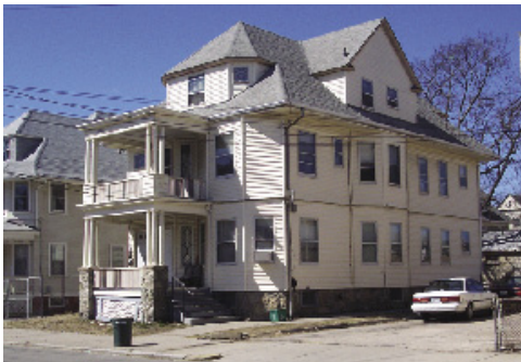
Before photo of 19 Stanwood Street - Providence, RI

As momentum grows for buildings with a reduced, or zero, carbon footprint, one sector has received little attention - affordable housing. Without significant improvement to that critical piece of existing building inventory, though, overall reductions in energy use will prove elusive.