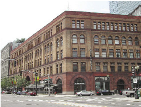
142 Berkeley Street - Boston, MA

Engine Room Edit is one of Boston's top creative post-production companies, specializing in video and graphics editing for film, television and the internet.