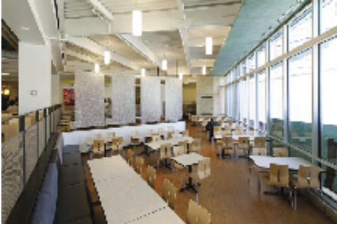
Dining hall lower seating, Kennedy Campus Center at MassArt - Boston, MA