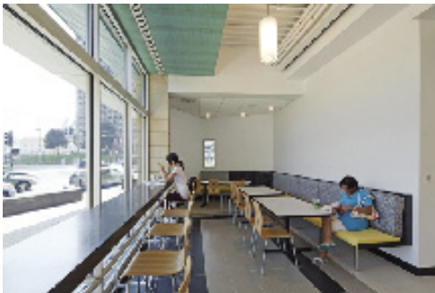
Dining hall, Kennedy Campus Center at MassArt - Boston, MA