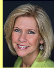
Rita Joy Interscape Commercial Environments